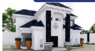
300 SQM 4 Bedroom Penthouse