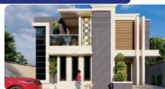
400sqm 4 bedroom fully detached Duplex