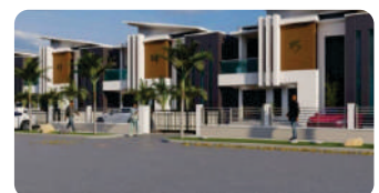
300sqm 4 bedroom Terrace duplex