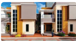
200 SQM 4 Bedroom Terraced Duplex